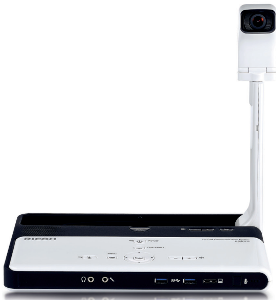
The P3500M - Ricoh's portable video conferencing device.